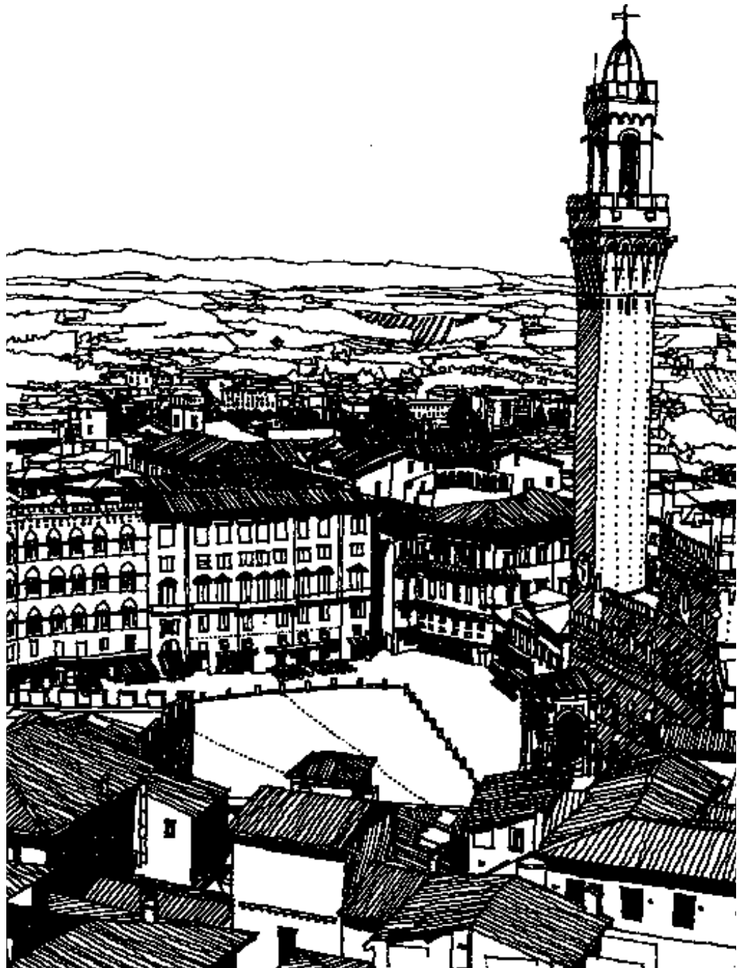
Figure 7.6 Siena by Francis Tibbalds.